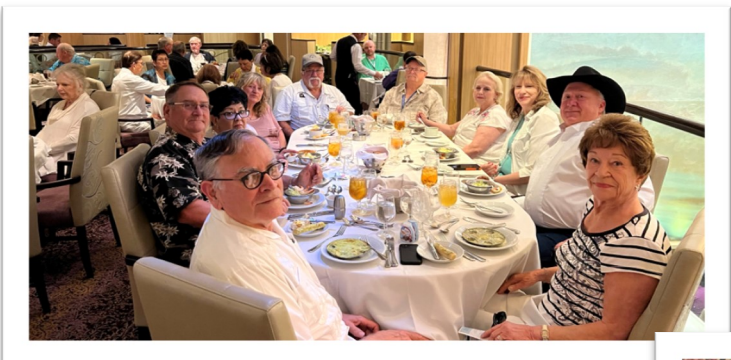
(above ) Wahoo Grotto Valentines "Gruise" (Grotto Cruise)