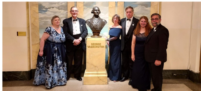
(below) George Washington Masonic Memorial