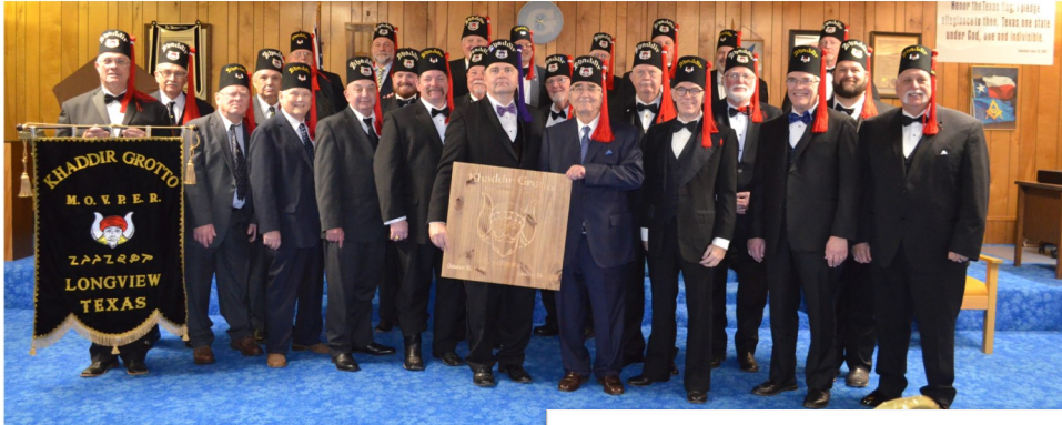
Khaddir Grotto Longview, Texas January 28th, 2023