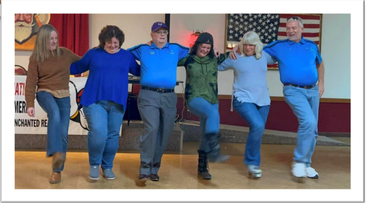
(right) Ohio Grotto Association knows how to have fun!