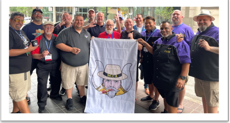
(above) Mokanna Cigar Afficianados gathered together.