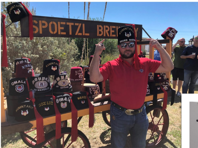
(below) Members of Lier Grotto having fun