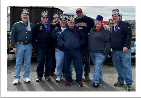
(above) Members of the Ohio Grotto Association and Daughters of Mokanna visited East Palestine, Ohio to hand out water.