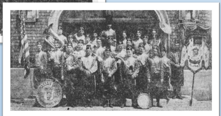
(Right) Mohassan Grotto