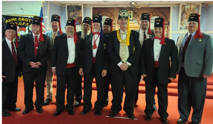
Armi Grotto Dade City, Florida March 4, 2023