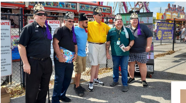
(left) Strawberry Festival in Florida