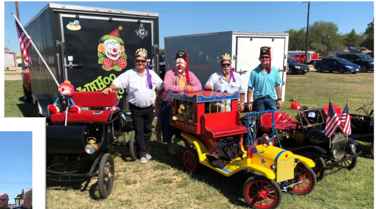
(left) Fez off!