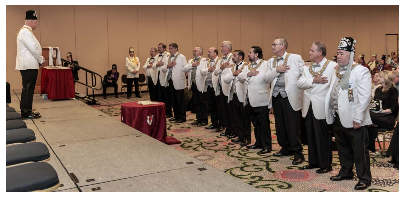
GRAND LINE OFFICERS TAKING OBLIGATION