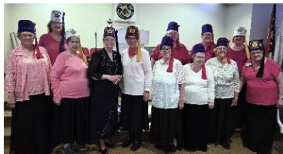
Al Sirat #11