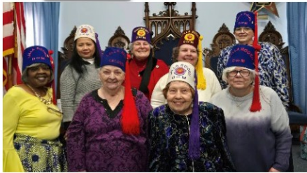
Lalla Rookh #68

Official Visits Completed ... Thanks for the Memories!