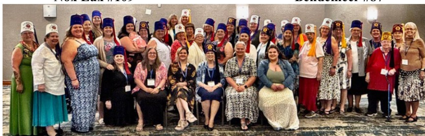
Initiation Ceremonial at Grottoes International Council Session