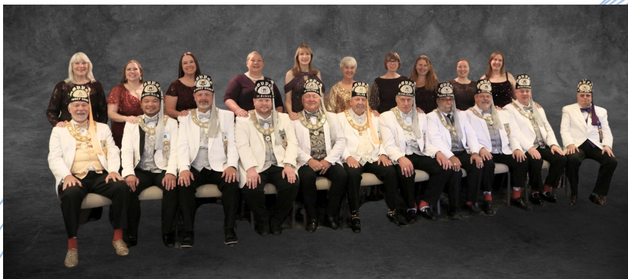
2025 - 2026 Grand Line Officers and Ladies