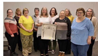
Amrou #23 Re-institution