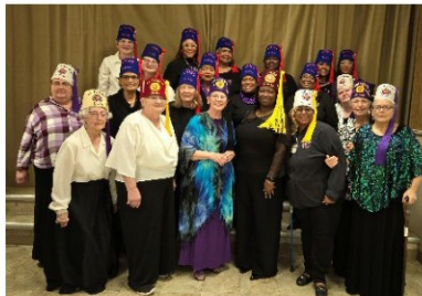
Aries #107 & El Karan #56