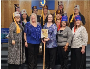
El Jaala #104