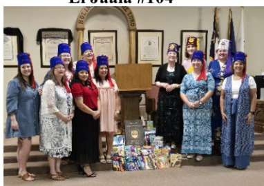
Nox Lux #109