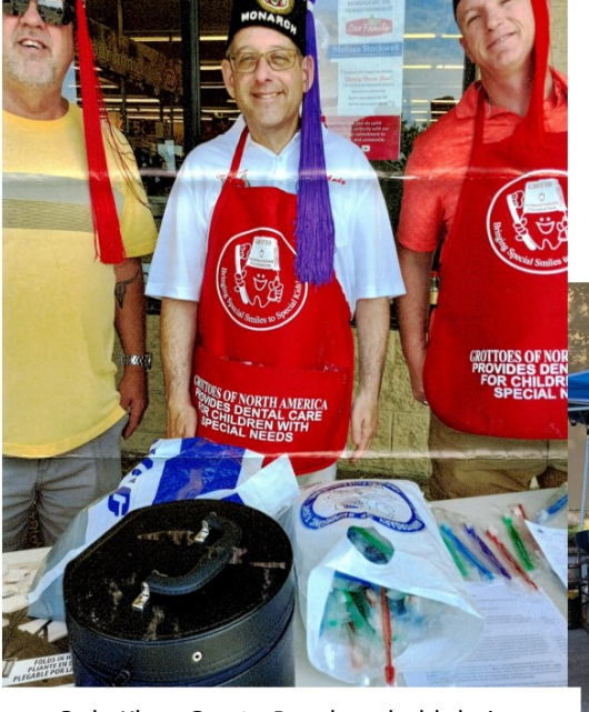
Oola Khan Grotto Prophets held their Toothbrush Day at Dillonvale IGA in Deer Park, Ohio of greater Cincinatti.