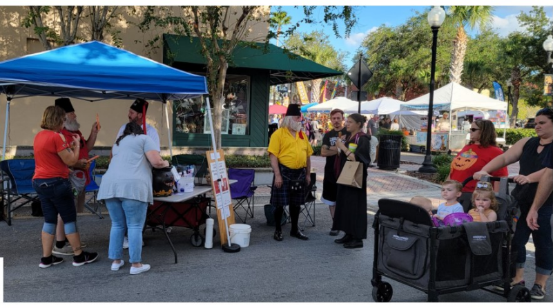
Armi Grotto Prophets at Main Street Zephyrhills, FL Halloween Howl.