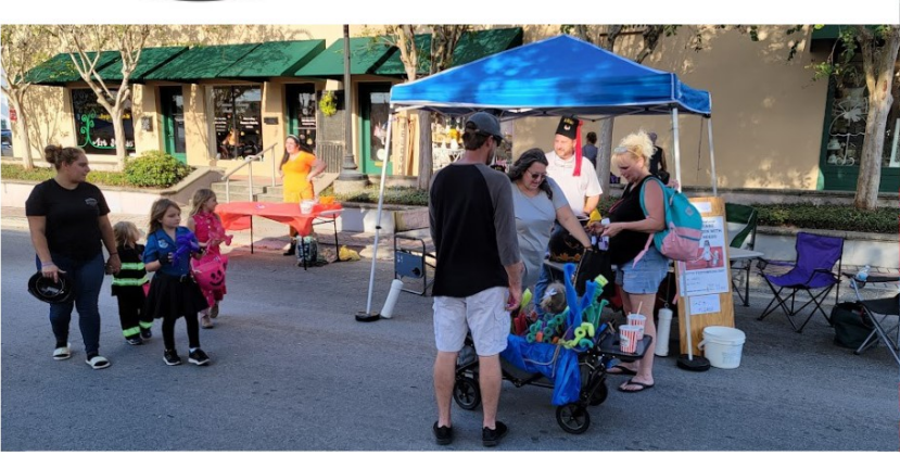
Armi Grotto Prophets held a 2nd Toothbrush Day at Main Street Zephyrhills, FL Halloween Howl.