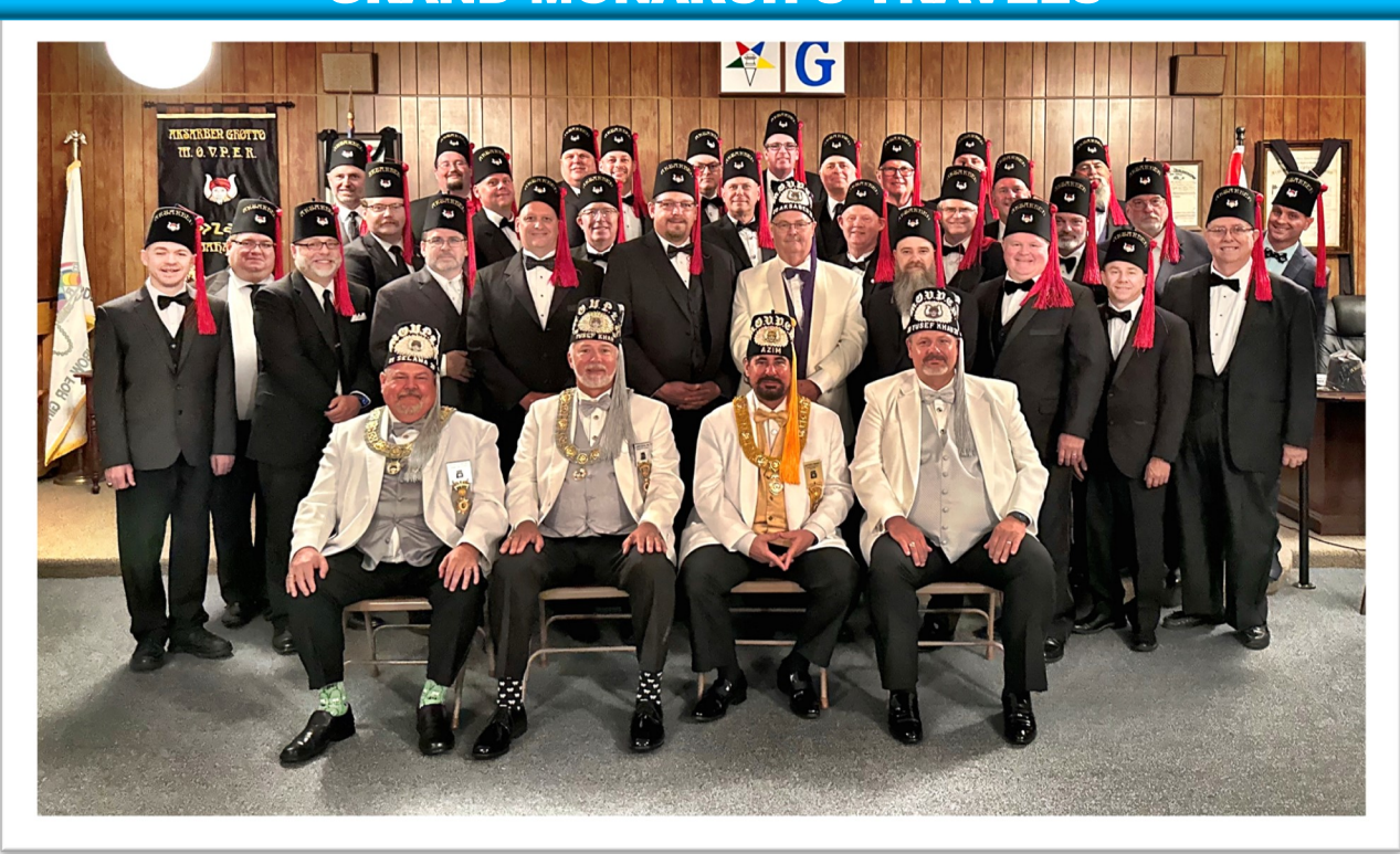
(Above) The Grand Monarch had the honor and privilege of instituting Ak-Sar-Ben Grotto on August 19, 2023 in Omaha, Nebraska.