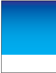
3/4 Page $225