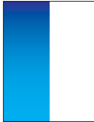
1/2 Page Vert. $175