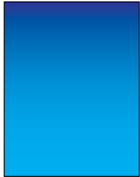
Full Page $300