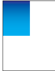
1/4 Page Vert. $85