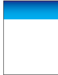
1/4 Page Horiz. $85