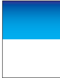
1/2 Page Horiz. $175